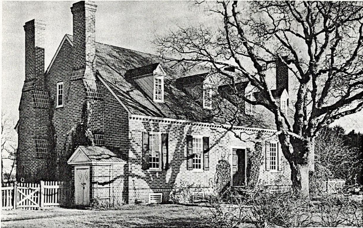
WAKEFIELD PLANTATION BIRTHPLACE OF GEORGE WASHINGTON. THIS IS A RECONSTRUCTED HOME BUILT ON THE ORIGINAL SITE AT POPE'S CREEK.