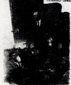
115 ANIV. DEL NACIMIENTO DE V. LENIN