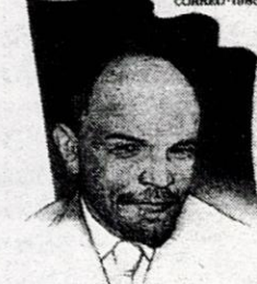
115 ANIV. DEL NACIMIENTO DE V. LENIN

The Sandinistas aren't hiding their alliances, just look at the above postage stamps. The above stamps commemorate: (L-R): The 115th Birthday of Lenin, the 25th Anniversary of Castro's rise to power; and the 100th anniversary of Karl Marx's death, and another of Lenin