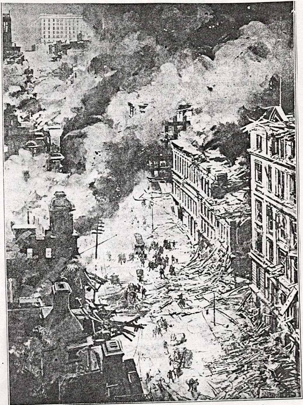
SAN FRANCISCO IN RUINS - APRIL 18th, 1906